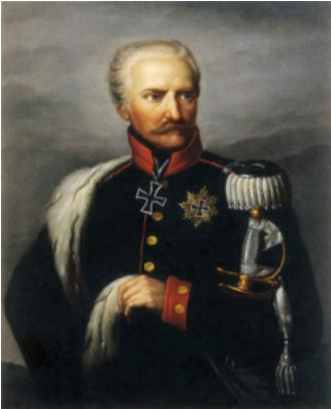
Prince Leberecht von Blücher

War and Forex Trading are quite similar in many ways. We, as retail traders are more like the Prince Blücher fighting Napoleon. We have less capital (a smaller, less capable army) and we don't have many allies to come to our help in case we guess the price direction wrong. However we can choose what battles to fight and how to fight them; that's our ONLY advantage and the one thing we can plan and do right as traders.